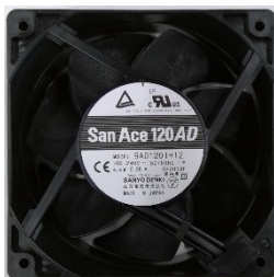
Position of the added UKCA mark

Appearance of the cooling fan (before change)