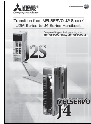
■ Transition from MELSERVO-J2-Super/J2M Series to J4 Series Handbook L(NA)03093

This guide explains the transition from the MR-J2S to the MR-J4.