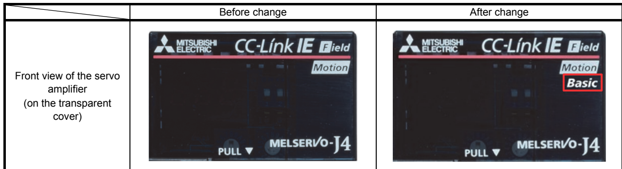
Table 1. Appearance change

The target servo amplifiers support CC-Link IE Field Network Basic, and thus their appearance has been partially changed. (Refer to Table 1.)