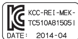
Figure 2.1 Before change