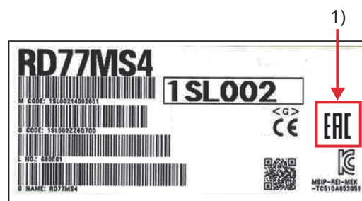
Figure 2. Print example of the packaging label (RD77MS4)