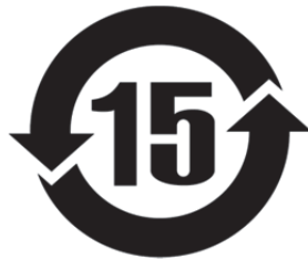
Figure 1 1 Environment-Friendly Use Period mark indicating the EFUP of 15 years