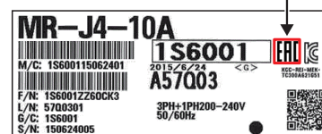
Figure 2. Print example of the packaging label (MR-J4-10A)