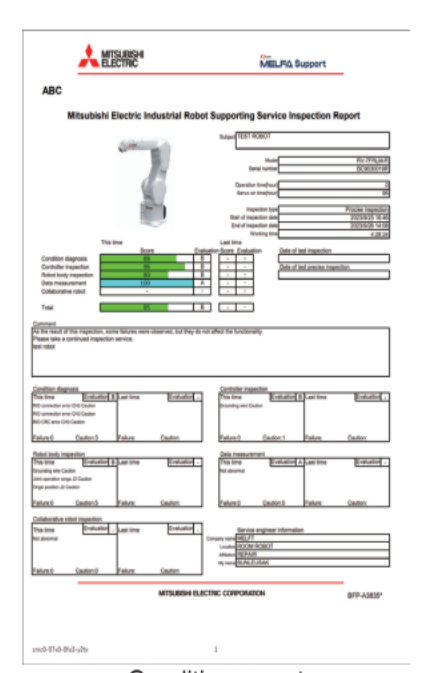
New item inspection Partially automated decision-making